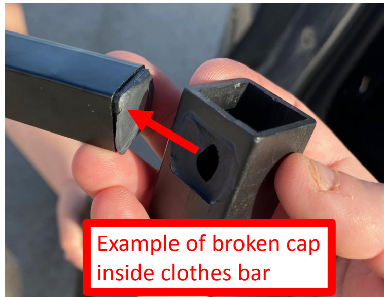
Example of broken cap inside clothes bar